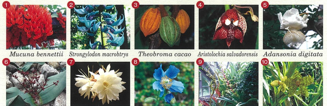
Welwitschia mirabilis Epiphyllum oxypetalum Meconopsis betonicifolia Vriesea imperialis Grammatophyllum speciosum

※Planting locations are subject to change. ※ Epiphyllum oxypetalum will be on display only during flowering time